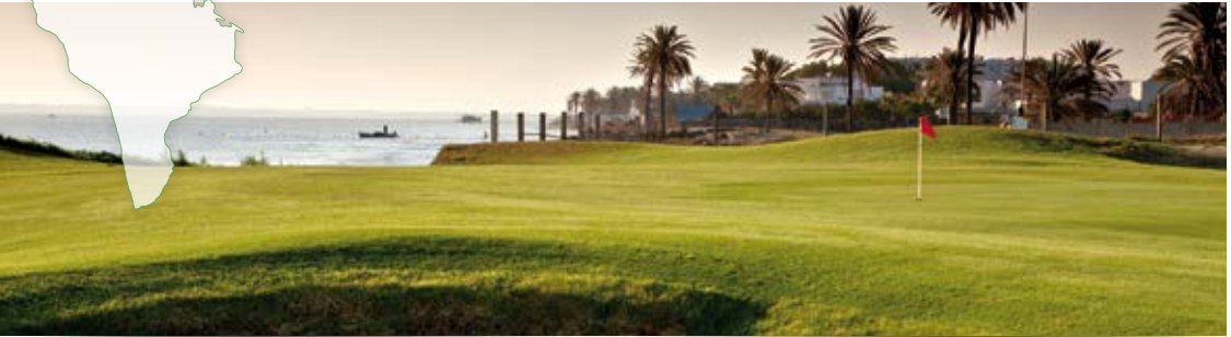
Palm Links Golf Course

South of Hammamet, Sousse and Monastir are simultaneously lively seaside resorts, historical cities and great golfing destinations.