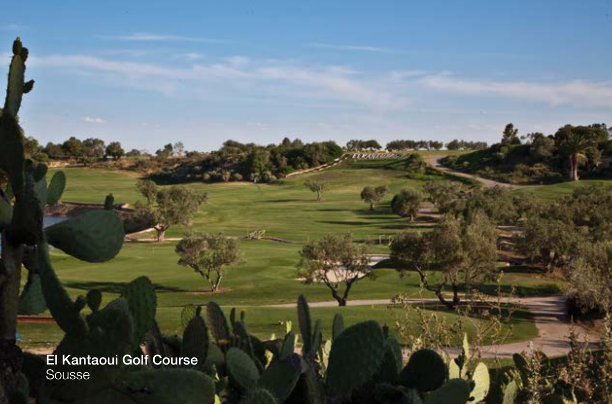
El Kantaoui Golf Course Sousse