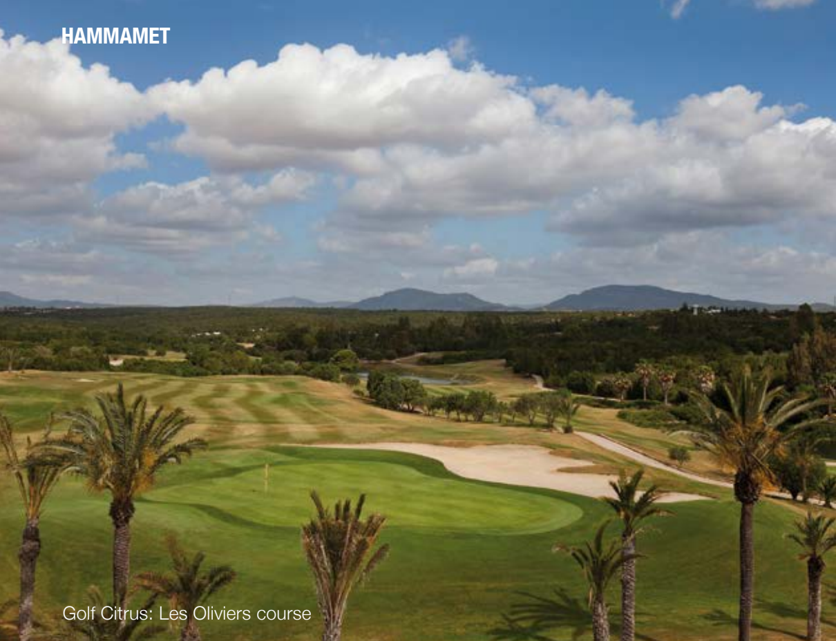
Golf Citrus: Les Oliviers course