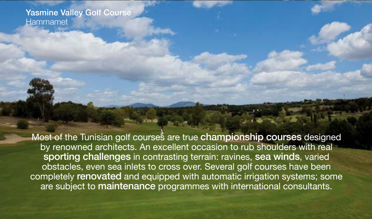
Yasmine Valley Golf Course Hammamet

Most of the Tunisian golf courses are true championship courses designed by renowned architects. An excellent occasion to rub shoulders with real sporting challenges in contrasting terrain: ravines, sea winds , varied obstacles, even sea inlets to cross over. Several golf courses have been completely renovated and equipped with automatic irrigation systems; some are subject to maintenance programmes with international consultants.