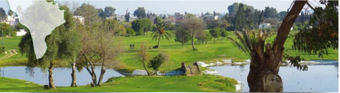
Golf de Carthage

Tunis is a city of contrasts. Its MEDINA is both full of life and a historical monument, home to modern trends and ancient histories; while the modern neighbourhoods offer shopping centres, lounges and restaurants. Twenty minutes away lie the Coasts of Carthage, coastal resort and FOCAL POINT FOR ENTERTAINMENT . The area has two golf courses . The first, CARTHAGE GOLF , is a small historic course created in 1927 and redesigned in 2013. With its lush Mediterranean vegetation and century old trees, it is an island of greenery on the doorstep of a modern city. The second, The Residence Golf Course , stretches between long sandy beaches and lagoons where migratory birds abound, just a few minutes from the village of Sidi Bou Saïd and the ruins of the famous city of Carthage .