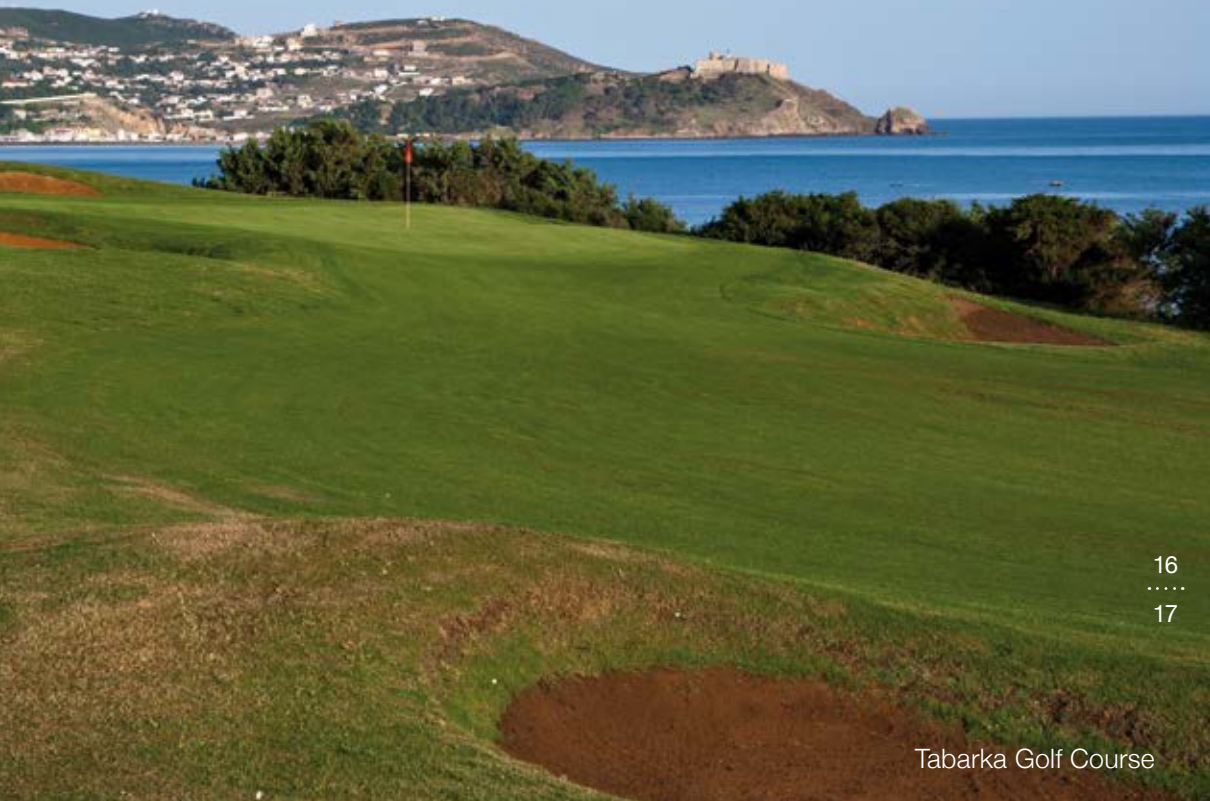
Tabarka Golf Course