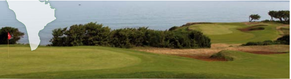
Tabarka Golf Course

Few golf courses in the world offer the MAGICAL COMBINATION of sea and forest which makes TABARKA GOLF COURSE so charming. A small city in the Tunisian Northwest, Tabarka certainly occupies an exceptional location: its golden sandy beaches are framed by rocky spurs and forests of pine and oak . The course at Tabarka calls back to the famous Cypress Point club, in California, designed by the same architect. Framed by mountains and forests of eucalyptus, oak and Aleppo pine, it offers views across a superb landscape. Unmissable: seven holes by the Mediterranean shore which force you across sea inlets! After your game, you can enjoy a seaside cruise, an outing into the forest, or a GOOD MEAL OF SEAFOOD in the marina.