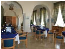
2 The beach.