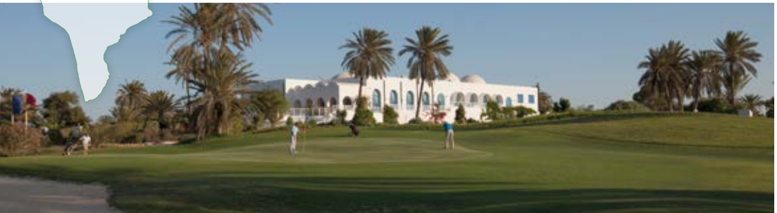
Djerba Golf Club

DJERBA GOLF CLUB extends alongside the sea and sand dunes , in a setting typical of this sunny island of the Tunisian Deep South.