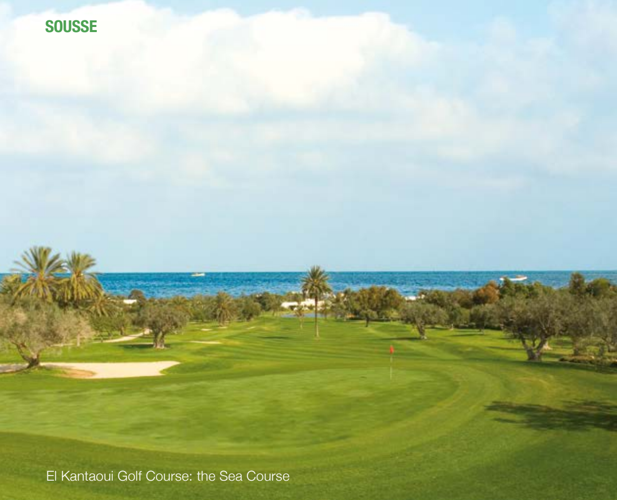
El Kantaoui Golf Course: the Sea Course