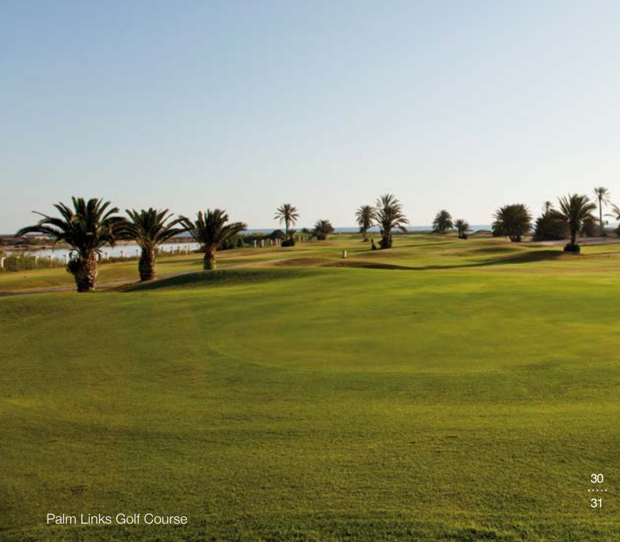
Palm Links Golf Course