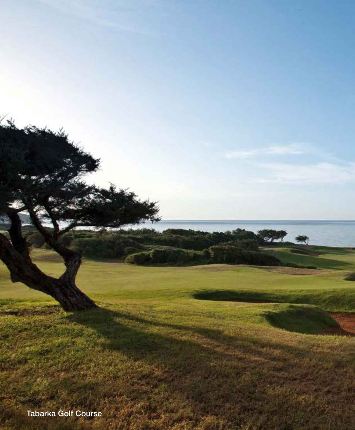
Tabarka Golf Course