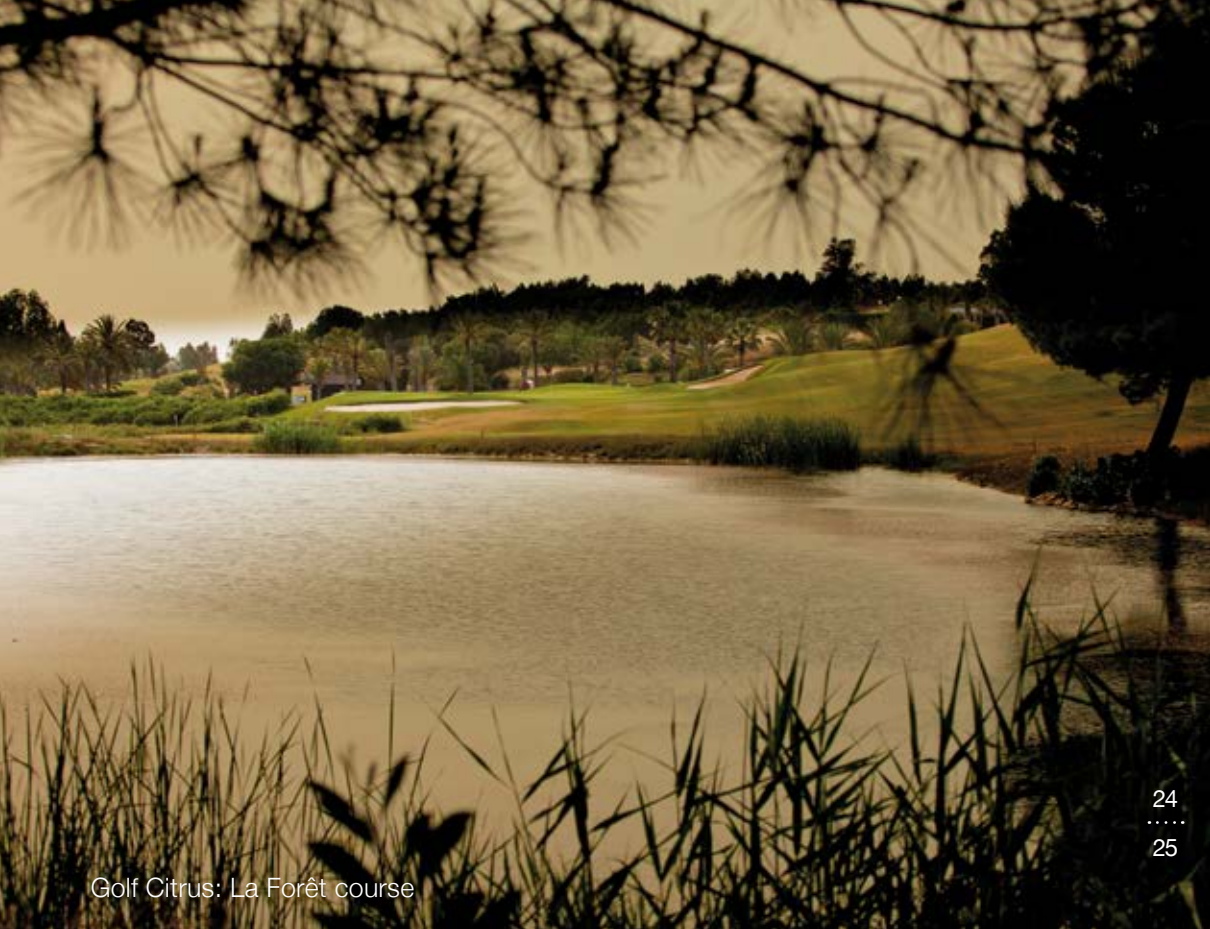
Golf Citrus: La Forêt course