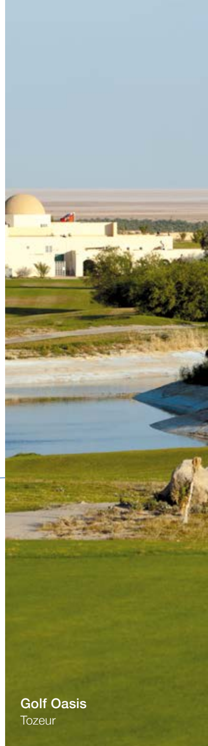
Golf Oasis Tozeur