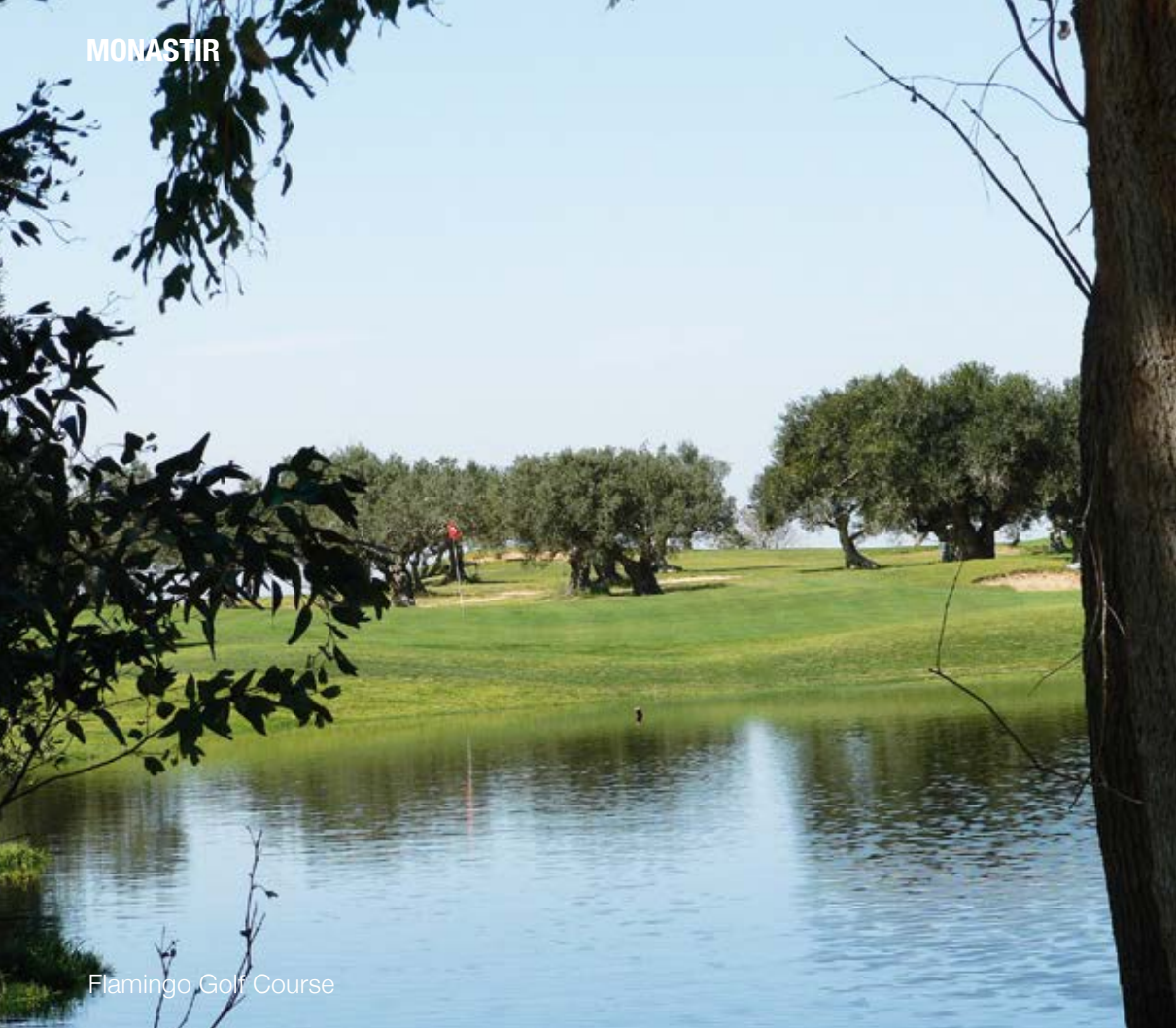
Flamingo Golf Course